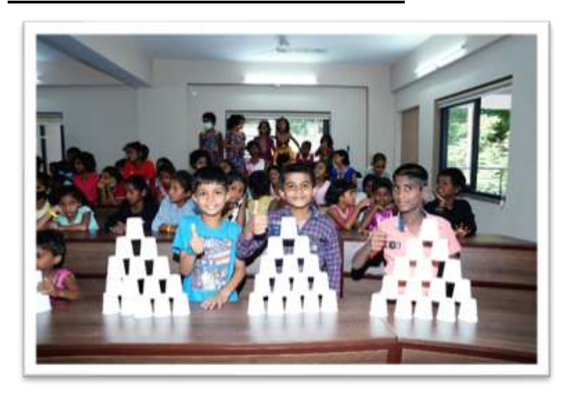
5. Paper cup building Competition