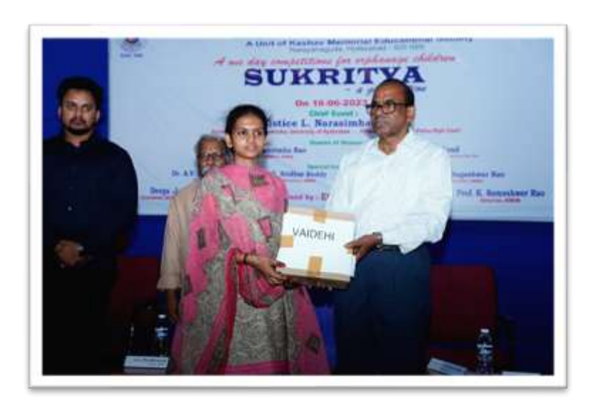
20. Books donated to all the orphanages by Chief guest along With other dignitaries on the dais