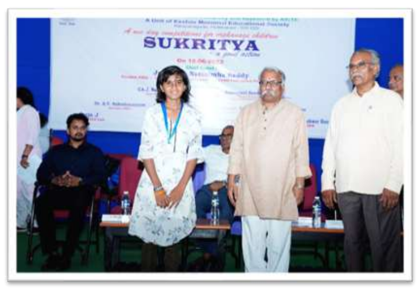
19. Prize distribution ceremony