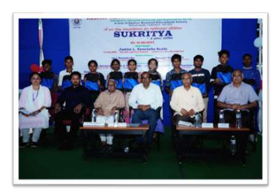
17. Goodies kits given to each children from orphanage.