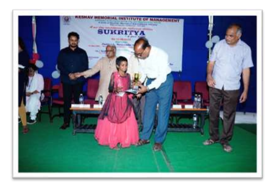
18. Prize distribution ceremony